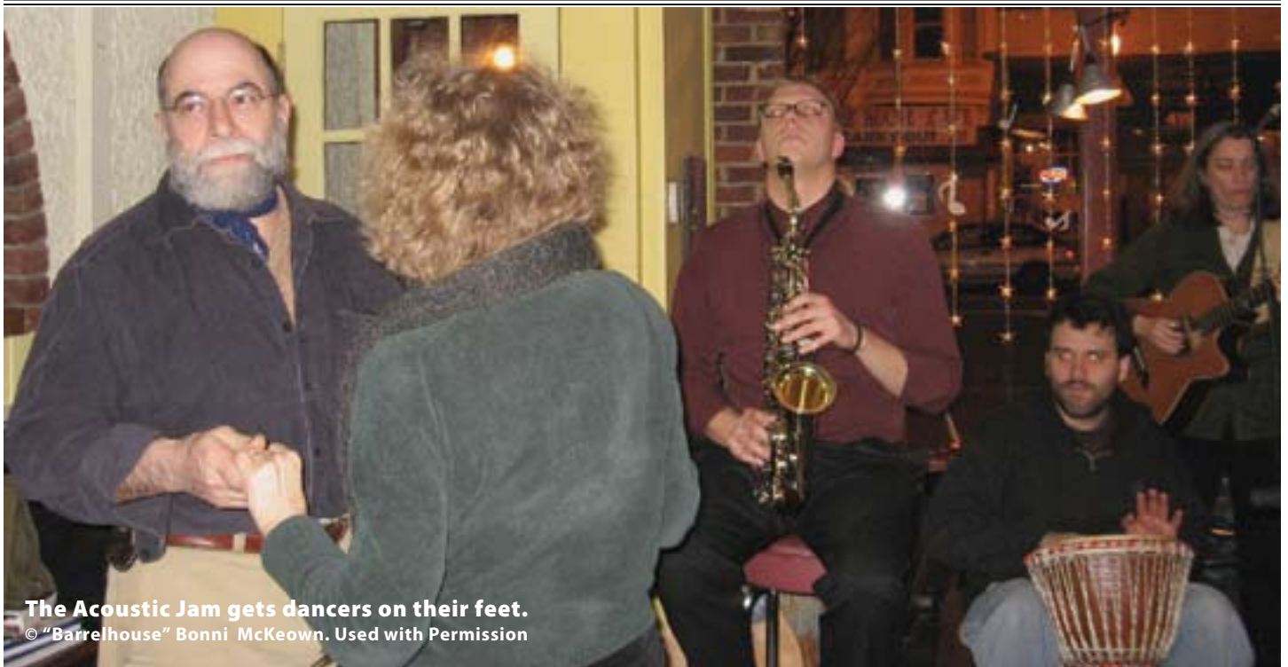
The Acoustic Jam gets dancers on their feet.