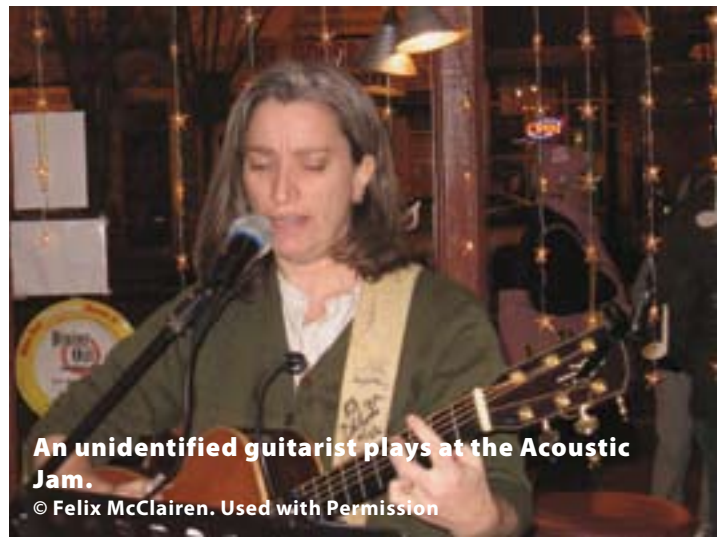
An unidentified guitarist plays at the Acoustic Jam.