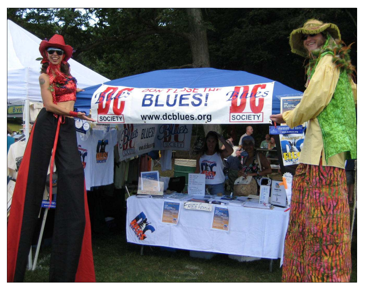
Here's proof that our members stand heads above the rest!