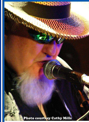
'The Braille Blues Daddy" ...a natural born houserocker with a whole lot of soul...

Purchase advance tickets: www.dcblues.org or call 301-322-4808 $10 Member $12 Non-member $15 at door