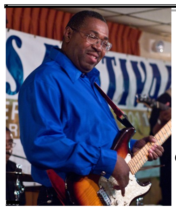
Saturday, November 12