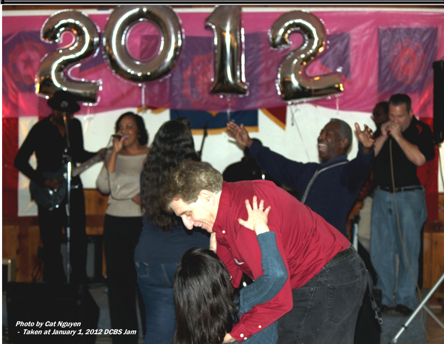
Taken at January 1, 2012 DCBS Jam