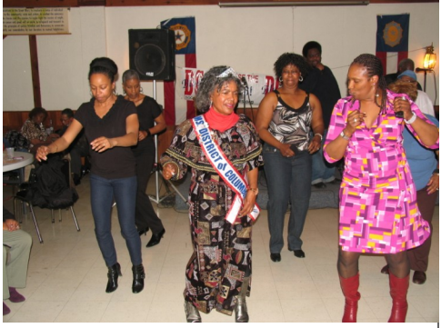
The dance floor was typically filled all night, even during the band's break between sets!