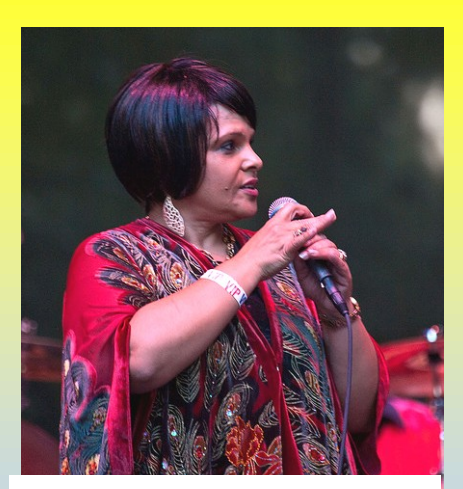
Teeny Tucker Tinner Hills Blues Festival

June In The DC Area So Many Options For Blues Festivals & Performances