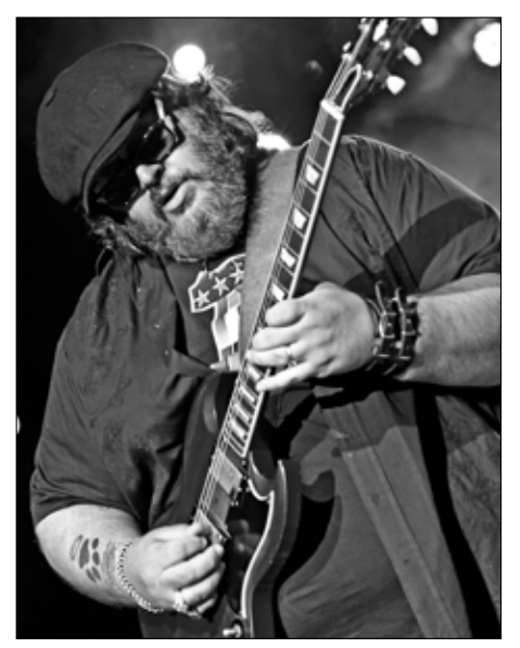
DCBS welcomes the world class blues of the Nick Moss Band, featuring the explosive guitar style of frontman Nick Moss to its April 18 fundraiser to support the DC Blues Festival.

Doors open at 6pm, the music goes from 7pm to 12midnight. American Legion Post 41 is located at 905 Sligo Ave., Silver Spring, MD 20910. Wear your tank tops and shorts, it's gonna be a hot night!