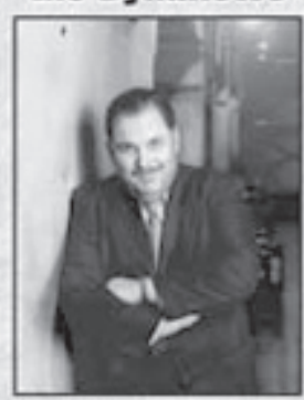
Sunday at 5:30 PM (Field Stage)