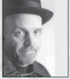
Saturday at 5:15 PM (Field Stage)