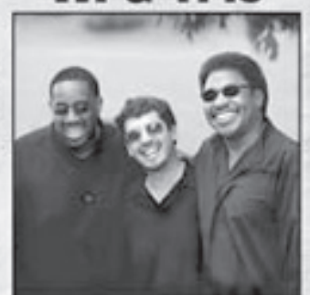
Saturday at 1:15 PM (Field Stage)