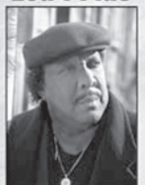
Sunday at 7:00 PM (Field Stage)

Pick up your copy of Lou Pride's "Words of Caution" at the festival or call Severn Records at 877-923-2275. CD's also available online at www.severnrecords.com. And check out Louisiana Red's "A Different Shade of Red - The Woodstock Sessions".