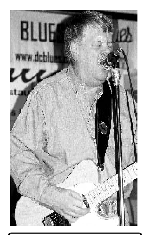
Another shot from the February jam.