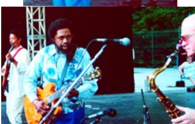
Son Seals on guitar at the D.C. Blues Festival in the mid-nineties.