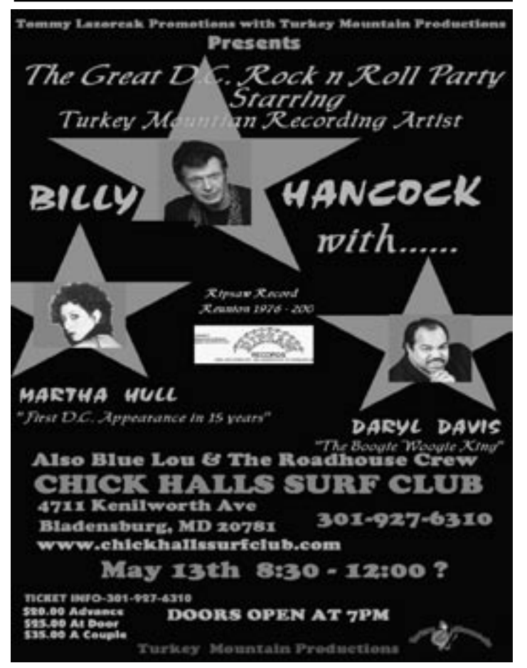
DC Blues Calendar May 2006 p. 7

For information on Sponsorship see the Society's webpage at www.dcblues.org.