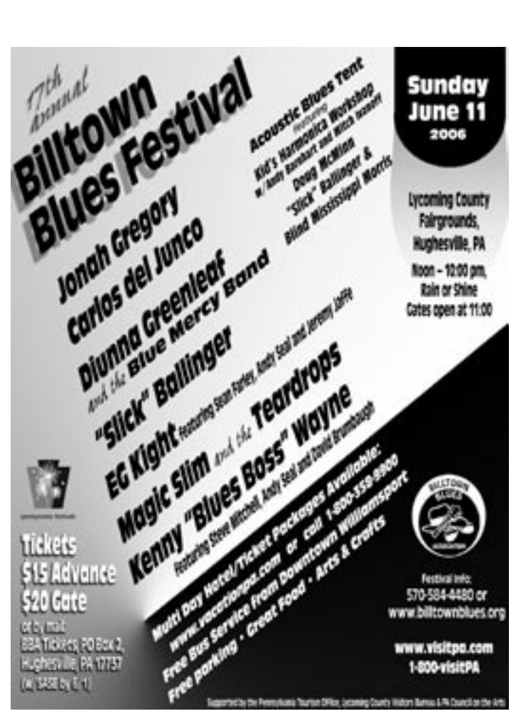
DC Blues Calendar May 2006 p.3

During their tenure on the Board, the Society also held several Holiday parties there and it was the site of Board and Festival Committee meetings for several years. The jam will take place from 4PM to 8PM and there will be a raffle to benefit the youth programs of both organizations. The Departmental Progressive Club is located at 411 Gibbons St. in Alexandria, VA 22134 and its telephone number is 703-549-9518. More on this next month.